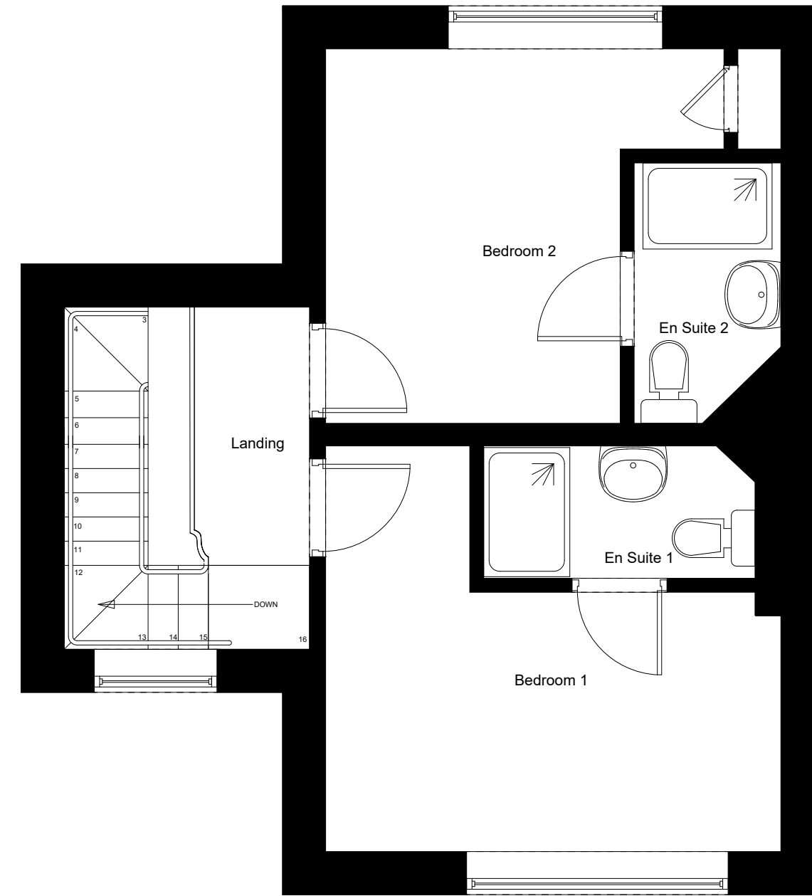
2 The Winnings - First Floor